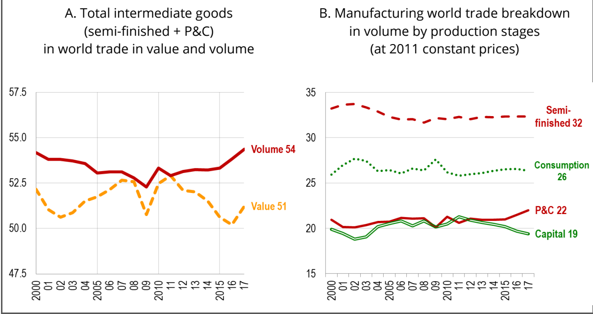
Chart 3: Share of intermediate goods in manufacturing world trade (%)