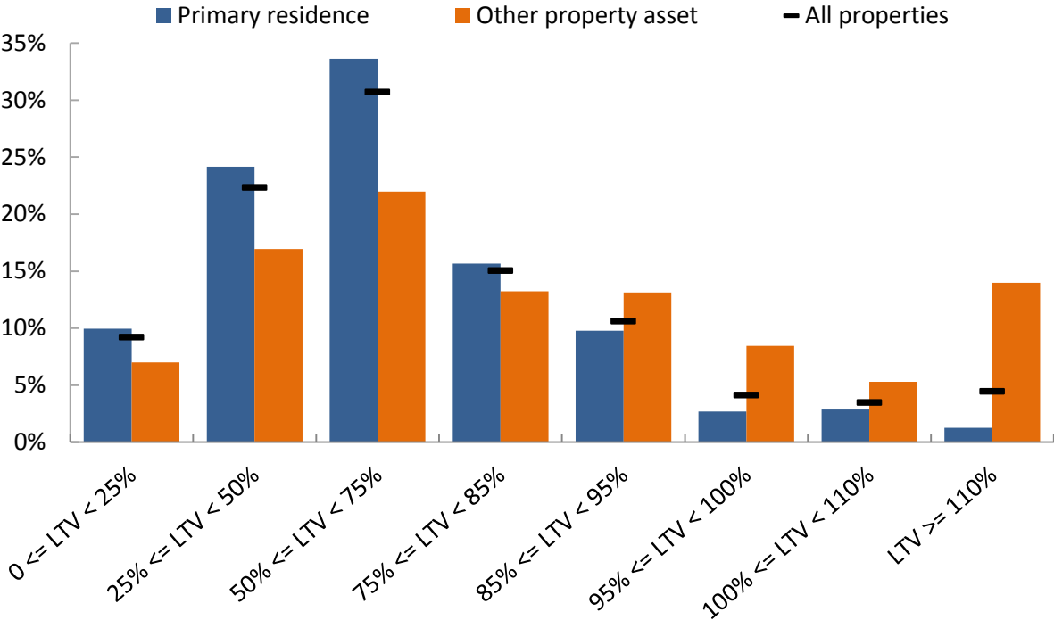
Chart 1: Lower LTVs for primary residences (% of the 2014 value of the property)